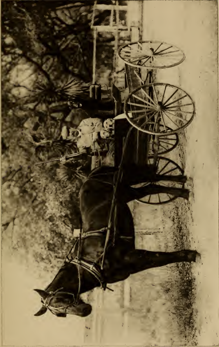
GAMEKEEPER AND HIS DOGS